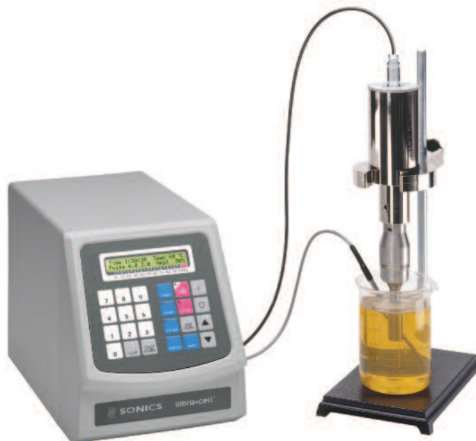
VCX 500 – VCX 750